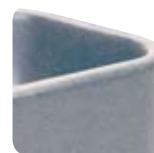
Granite Gray (191)

Tray Rail and End Table Colors: Granite Gray (191), Sandstone (614).