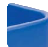
Navy Blue (186)