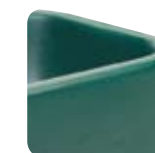
Kentucky Green (519)

Tray Rail and End Table Colors: Granite Gray (191), Sandstone (614).