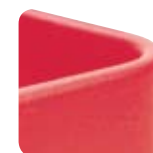
Hot Red (158)